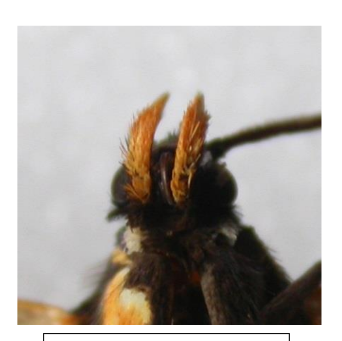
Large Red-belted showing orange palps